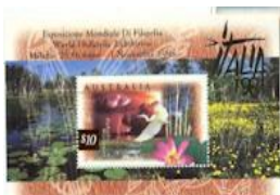
One of Cover Connection's lots sold on eBay in December 2007